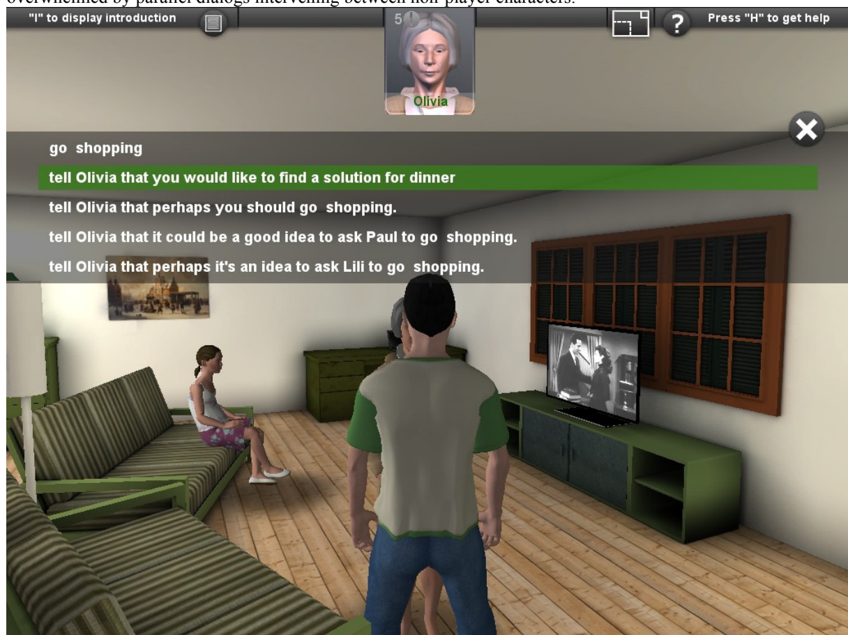
Figure 1: The user interface when interacting with a NPC

To design a user interface (UI) for an interactive drama is challenging. The UI needs to offer many possible choices (e.g. 10-15), while remaining unobtrusive, in order to favor immersion. Furthermore, the user risks being overwhelmed by parallel dialogs intervening between non-player characters.